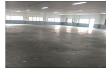
一般保管用スペース AIR CONDITIONER CONTROL ROOM