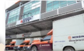
Airport office (Suvarnabhumi airport)

RM.13-15 Building AO 4, Free Zone Suvarnabhumi Airport, 999 Moo 7, Tambol Racha Thewa, Amphur Bang Phli, Samut Prakan 10540 THAILAND TEL: (+66)-2-134-7001~8 FAX: (+66)-2-134-6766~9