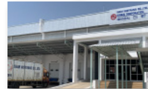
Dangerous goods warehouse

RM.13-15 Building AO 4, Free Zone Suvarnabhumi Airport, 999 Moo 7, Tambol Racha Thewa, Amphur Bang Phli, Samut Prakan 10540 THAILAND TEL: (+66)-2-134-7001~8 FAX: (+66)-2-134-6766~9