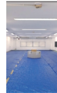
空調保管用スペース AIR CONDITIONER CONTROL ROOM