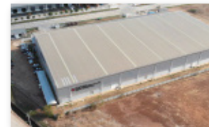
Prachinburi (Rojana) warehouse

T-park Bangna WH DG 6/2, 70/2 Moo 5, T.Bangsamak, A.Bangpakong, Chachoengsao 24180 Warehouse area : 1,000 m 2